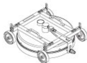
maximum retracted wheels