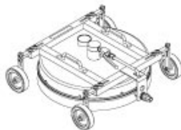
maximum extended wheels